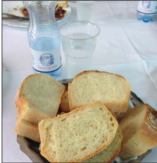
Bread and water in Medjugorje

Fortunately this man was very open to my suggestion. I told him to start very slowly and work up to it, and then I shared with him some of the