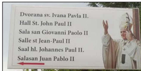
Sign pointing to the St. John Paul II Building in Medjugorje

Editor's note: For Our Lady's Prayer for the Sick, go to spiritofmedjugorje.org/oct2006.htm . I always enclose it with the prayer cloths. To receive a prayer cloth, please see page 8.