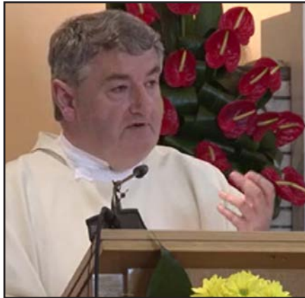
The Irish priest giving the homily