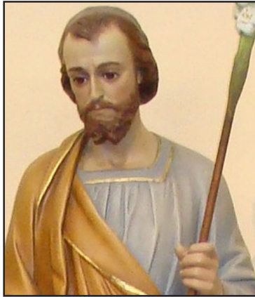
St. Joseph statue in Medjugorje