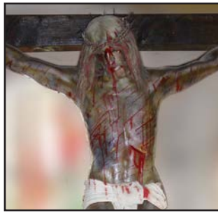
Corpus of Jesus in Medjugorje