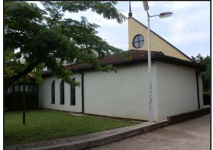
Adoration Chapel in St. James in Medjugorje

In the first reading, we had words that I consider really powerful words. "We hold this treasure in earthen vessels that the surpassing power may be