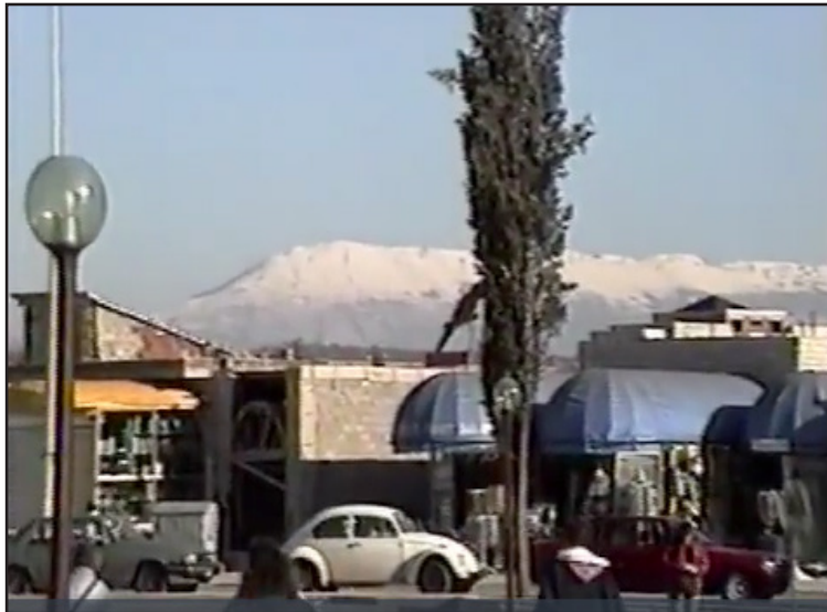
Medjugorje in 1990