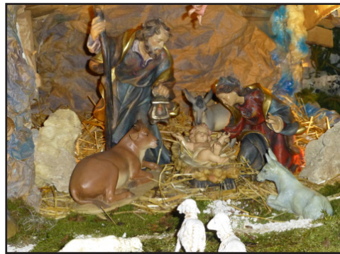
Christmas crèche in Medjugorje