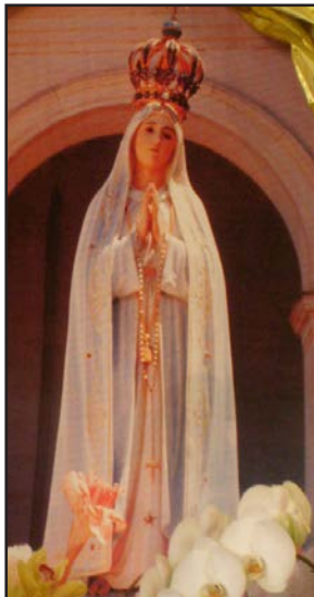
Statue in Medjugorje of Our Lady of Fatima in 2011