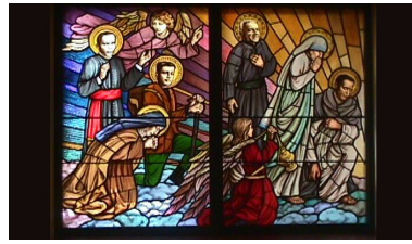
St. Martin de Porres, far right, on the window at the Bread of Life Adoration Chapel in Erie, PA

St. Martin de Porres, please pray for us!