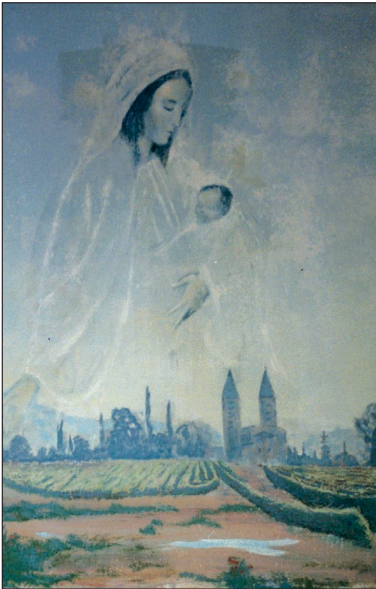
On January 1, we celebrate the Solemnity of Mary, Mother of God. This beautiful picture above was taken in the waiting room of a dentist's office in Medjugorje in 1999.