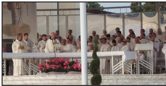
Mass in Medjugorje

During this year, the Centennial of Fatima, we hope to encourage you to fast and sacrifice more. As one sacrifice, could you possibly forgo buying lunch or snacks for yourself one day and use that money to have a Mass said for Our Lady's intentions? That would be a good sacrifice for the ultimate sacrifice – the Holy Sacrifice of the Mass! Through many missions, the stipend is only $5!