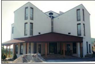
House of Peace in Medjugorje

People here come to the source; this is where they discern a thirst for the sacred, a thirst for God, a thirst for prayer which they discover to be an immediate contact with God.