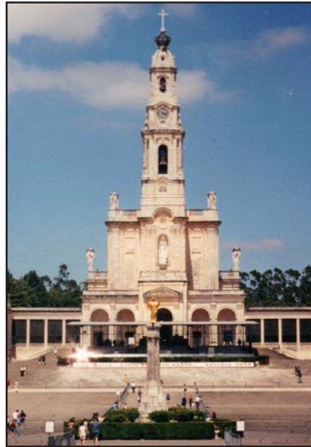
Basilica in Fatima

Millions of pilgrims come each year to pray at the Fatima shrine. On the 13th of each month, people from a different region in Portugal come to thank Our Lady for appearing in their country. But on May 13, people from the whole country of Portugal come, to honor Our Lady. Some walk 100 miles or more with just the clothes on their backs and carrying the food they will eat. As they enter Fatima, some fall to their knees and walk the rest of the way on their knees. The Army sets up huge tents for them, and some sleep in the open fields. My husband and I witnessed this.