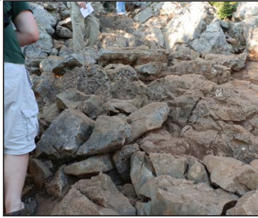
Rocks on Mt. Krizevac

I personally experienced this oneness with a complete stranger the day our pilgrim group climbed Mt. Krizevac. The mountain was steep. The climb was slow and arduous. The path was filled with large and small sharp rocks. One had to be careful not to slip and fall. I was having a bad day. I was not experiencing the peace and joy that everyone else seemed to have. I was hot, tired from not sleeping the night before, and frustrated. I couldn't seem to pray at all; I just couldn't get past the words, "Hail Mary." And yet, I heard several pilgrims saying, "I wish I could pray this easily back home." When we got to the top of the mountain, I had had it. My husband asked me if I wanted to say the family Rosary. I snapped at him, "No!" My son said he had already said several Rosaries that day. Really??? And I couldn't even say one Hail Mary! I finally sat down on a rock alone and cried. Eventually I decided to forget myself and talk to God about it. What did He want? My answer was "Penance." I felt He wanted me to take off my shoes and socks and walk down the mountain barefoot as a penance. My husband thought it was too dangerous. But I didn't think twice about it; I just knew I had to do it if it was what God wanted.