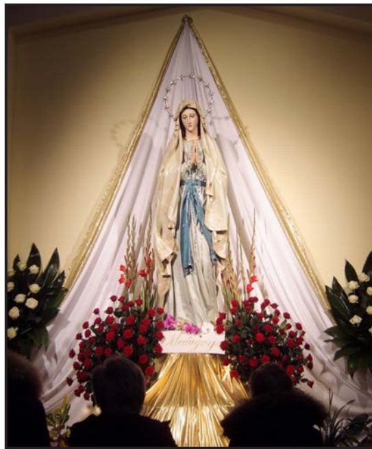
Statue of Our Lady in St. James Church