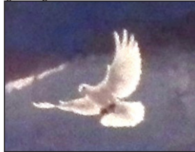
The Holy Spirit pictured on a mural in Tihaljina, near Medjugorje.

During a pilgrimage, our hearts open more and more to God's love, and so our thoughts and our prayers begin to change and our transformation continues. The peace beyond understanding becomes more apparent and we feel a difference in ourselves, something more intense than ever before. Becoming aware of the peace within us, we want others to share that peace and love of God. While going through the days of pilgrimage, it seems words that have been given to us are being lived in a new way in our individual lives. "You, little children, open the door of your heart