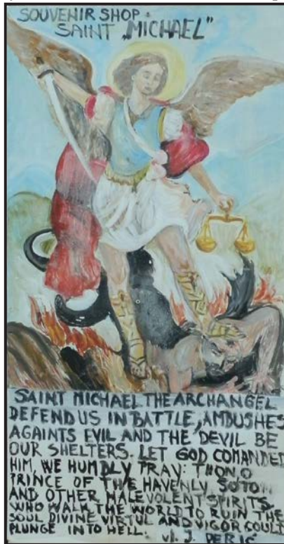
Painting of St. Michael on a building in Medjugorje

One time someone asked me, “Is Mary the fourth person of the Holy Trinity?” I'm scratching my head saying, “How