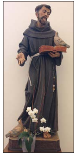
Statue of St. Francis in Tihaljina, not too far from Medjugorje

The last great event of his life happened two years before he died. Francis had a vision of a Seraph above him holding a Crucifix. And from the body of Our Lord, these beams came down and penetrated Francis' body. When the vision finished, he discovered he had a gash on his right side, and on his palms and on the top of his feet... we call them the stigmata, but they are not the kind of stigmata that you are all familiar with. They were not holes in his hands and feet... What he had were fleshy black outgrowths; and on the palm, they were like the head of a nail, and on the back of his hand, they were like a nail bent over. The same on his feet. These caused him great pain. Now he was marked with the same wounds as our