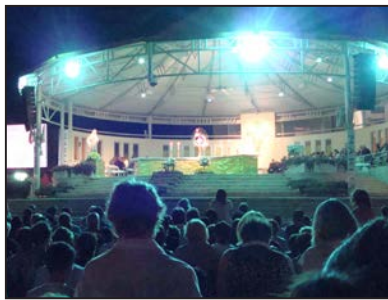
Outside Adoration in Medjugorje