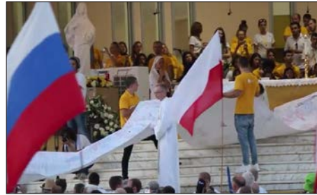
Banner with petitions

There is a big banner over here that we can write our petitions on, and then in the closing ceremony, this banner is spread and handed from pilgrim to pilgrim. It starts in the back of the crowd of people and we all have our hand