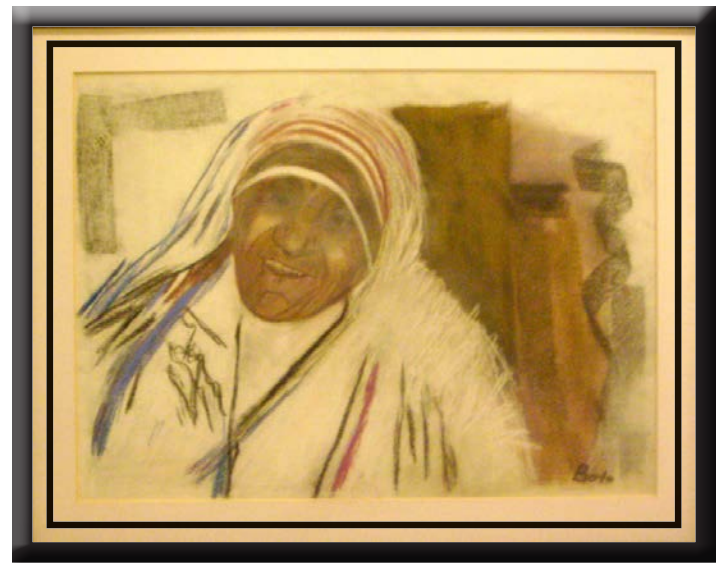
Painting of St. Mother Teresa in the art museum in Humac, near Medjugorje