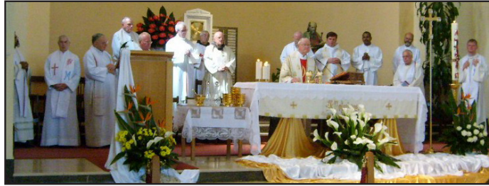
Mass in St. James in Medjugorje

So the Mass has this tension and...we need silence before Mass to prepare to celebrate the Sacred Mysteries. The Liturgy reminds us constantly that what we're doing is actually what's going on in Heaven all the time, and we're just "plugging in" to it. Think about just before the Holy, Holy, Holy (the Sanctus). We say we join in the angels and