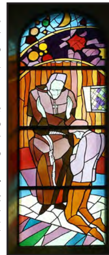
Stained glass window in St. James in Medjugorje

If we want to look into our hearts, we will always be able to find something that is preventing our hearts to be open to God.