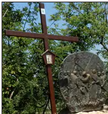
Station II on Mt. Krizevac