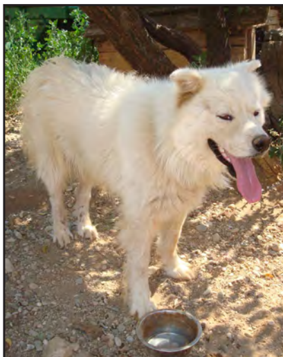
A "Medjugorje" dog

So I asked Father, "What is the significance of the dog barking before the screams start?" He replied, "As an Exorcist, I have seen many times that demons are afraid and hate dogs, because they (dogs) are so faithful and caring for human beings. At a conference I attended