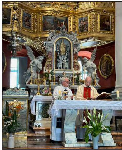
Mass at St. Blaise Church