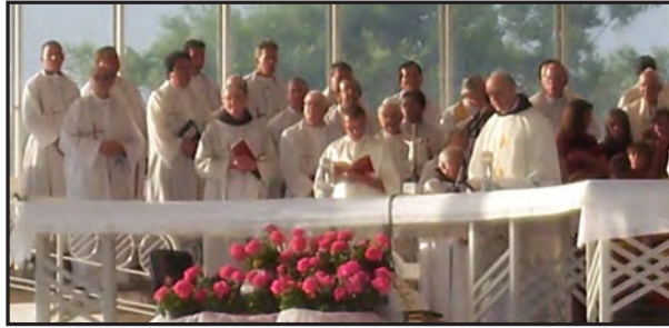
Outdoor Mass in Medjugorje

“The Mass is the highest form of prayer. You will never be able to understand its greatness” (13 January 1984). “Dear children, also today, in a special way, I wish to call you to the Eucharist. May the Mass be the center of your lives! In particular, dear children, may the Eucharist be in your families. The family must go to Holy Mass and celebrate Jesus. Jesus must be the center of your lives!” (15 June 2018).