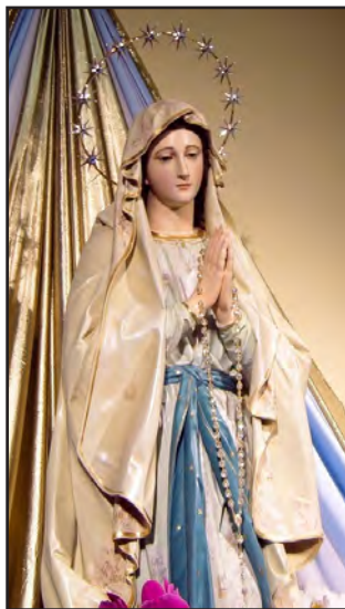
Our Lady of Lourdes statue in St. James Church in Medjugorje

Charlie Kirk, who was recently assassinated, ran an organization to teach young people how to live in this world, to be positive, to believe that God truly loves them, and this goes for the whole world! He helped more young people, sadly, than the Church is doing today. He took time with all his students and young people. Today some bishops tell us priests to stay away from the young people (because of scandal), so where in the world are the holy Vocations going to come from? Hardly any are entering Seminaries, as the bishops close them down. The priests are no longer there to encourage them, show